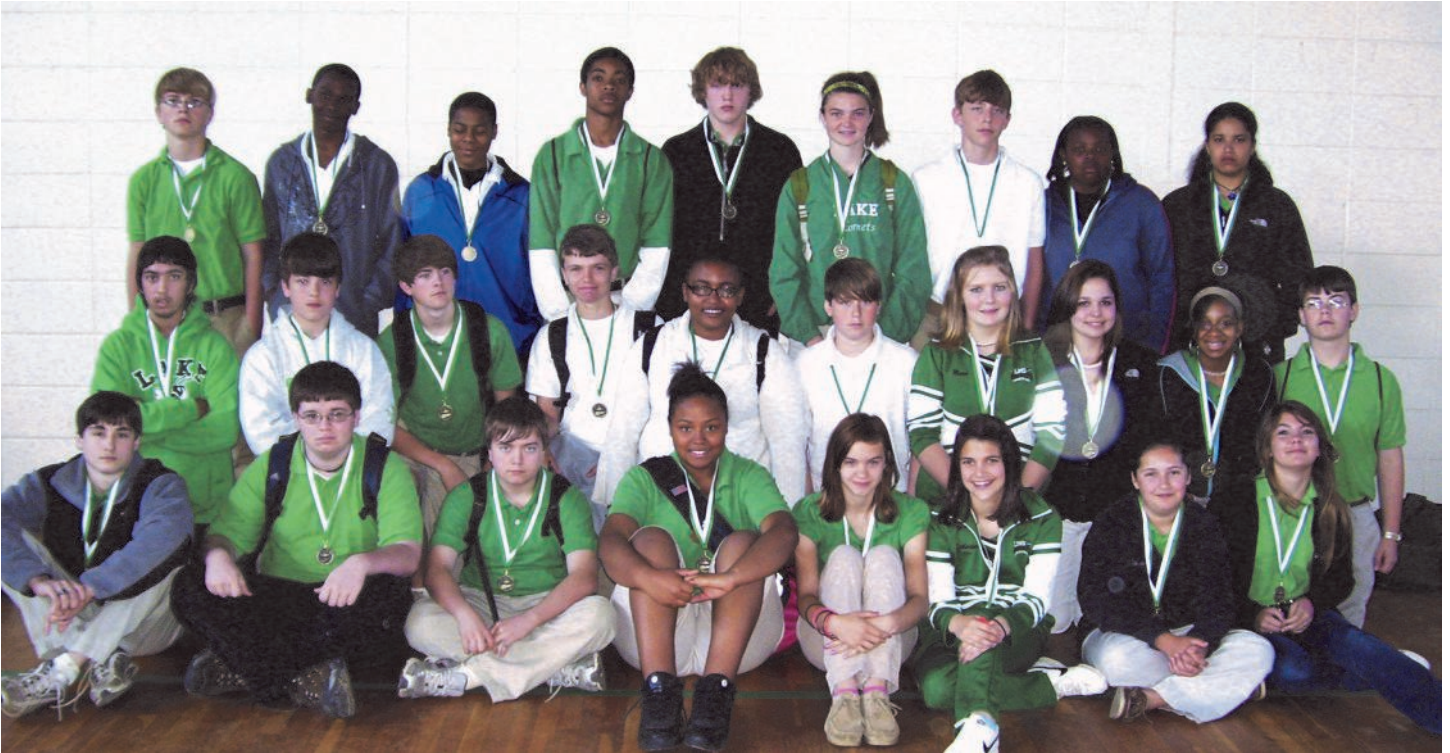
These are some of the 8th grade students at Lake Middle School who were honored for scoring proficient and advanced on the MCT2 test. They were presented medallions by their principal. YAC students sponsored a MCT2 Pep Rally for the presentations and gave away door prizes.