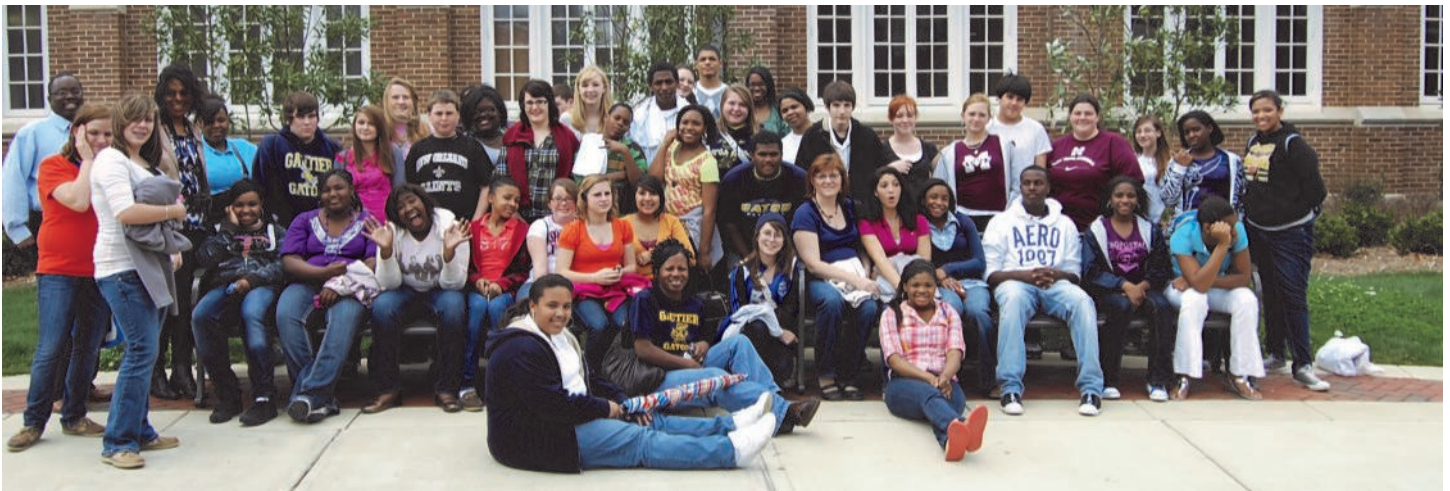
GEAR UP students from Gautier Middle School made a College Tour to Mississippi State University in Starkville. They posed for a group photo after the tour.