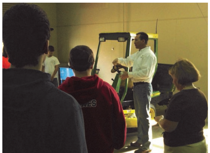
GEAR UP students from Coldwater Middle School made a College Tour to Northwest Mississippi Community College in Senatobia.