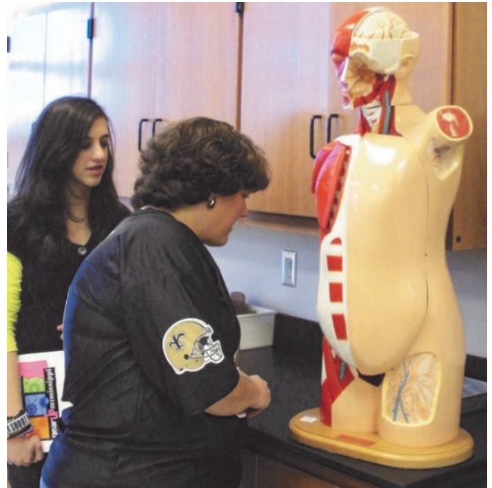
Students from Woolmarket Middle School made a College Tour to the Tradition Campus of William Carey University. The students were all members of the YAC at Woolmarket Middle School. As part of their tour, some of the students were able to go into the science lab and observe some of the teaching techniques and laboratories used in science courses at the university.