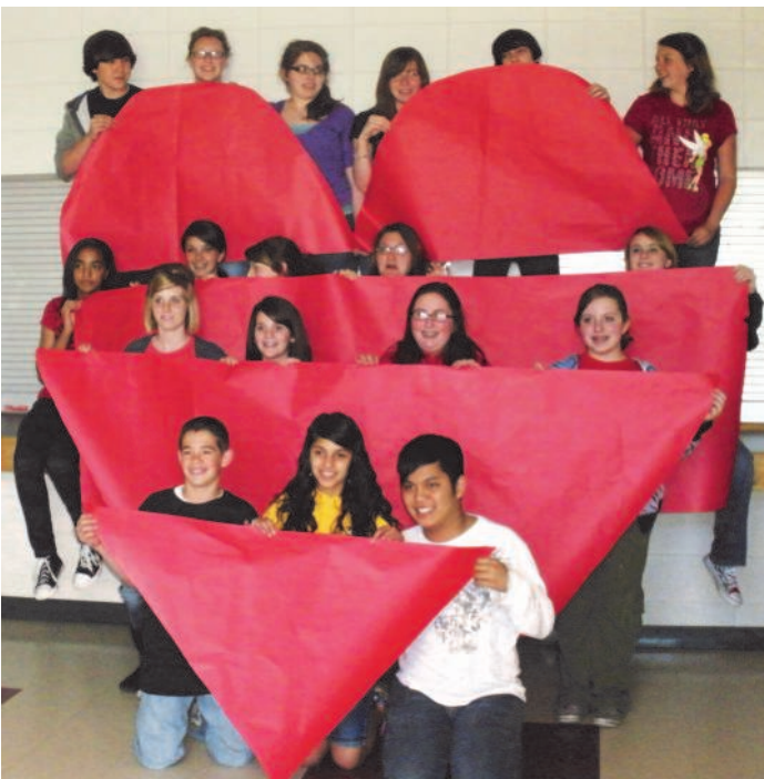
YAC members at North Woolmarket Middle School participated in the Mississippi Heart Association Walk-A-Thon April 17. It took place at the Mississippi Gulf Coast Community College. Many people participated and even brought their pets to walk for the Heart Association. The students made a heart shaped banner to use in the walk.