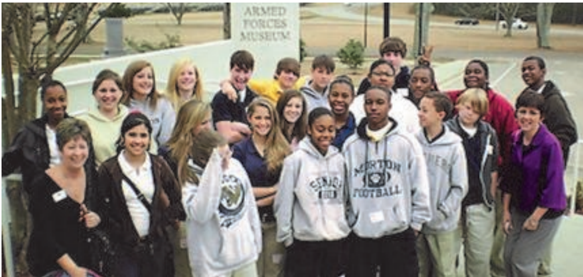
YAC members at Betty Mae Jack Middle School from Morton in Scott County enjoyed a field trip to Camp Shelby near Hattiesburg. During the trip they were given a tour of the camp and learned how the National Guard trains soldiers. One of the highlights was visiting the Armed Forces Museum at the Camp.